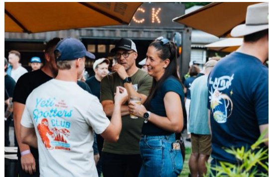
Luna® launch party