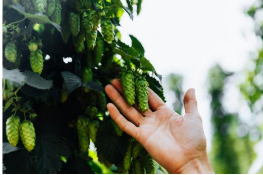
Vic Secret™ hop cones